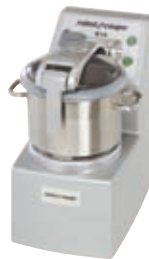
R 10 - R 10 V.V.