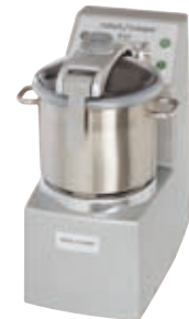
R 20 - R 20 V.V.