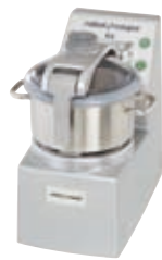
R 8 - R 8 V.V.