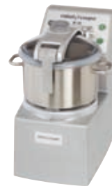
R 15 - R 15 V.V.